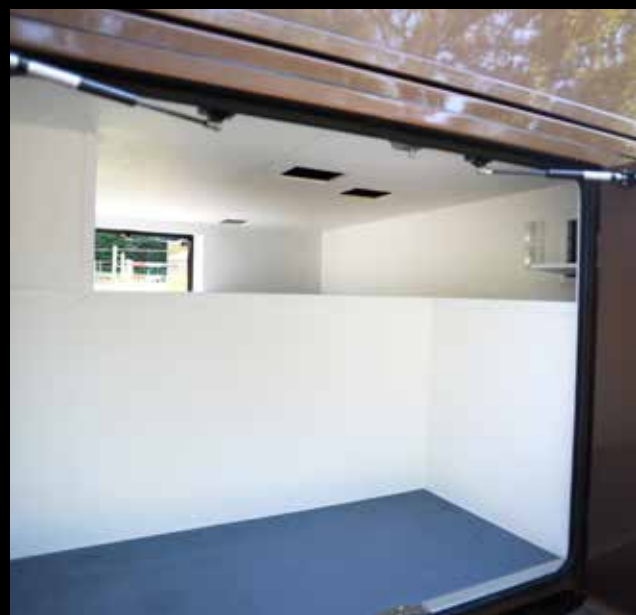
Slimline tack lockers in horse area, underslung to maximise space for saddles