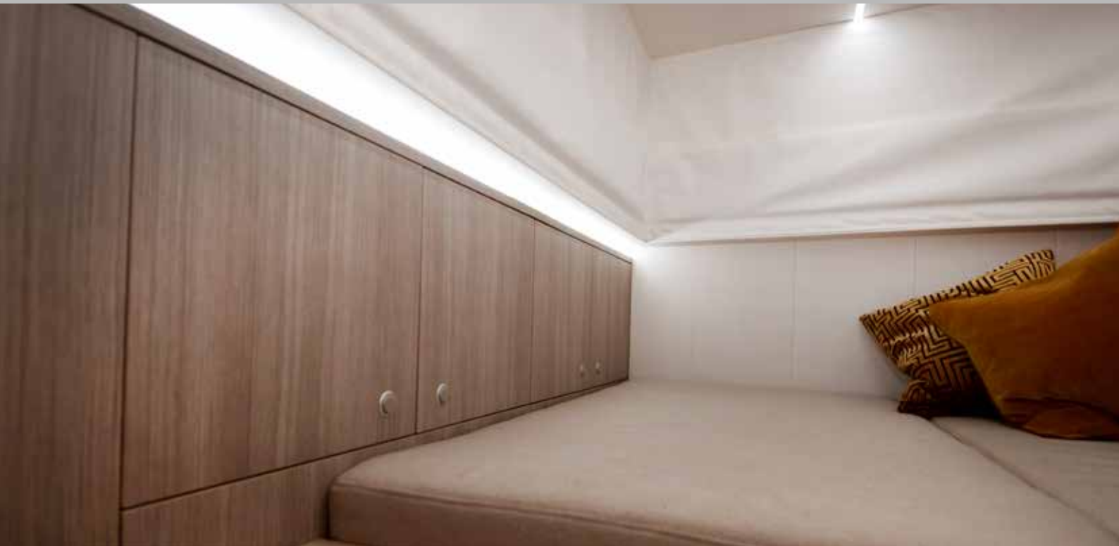
Beautiful living, bright, airy and spacious